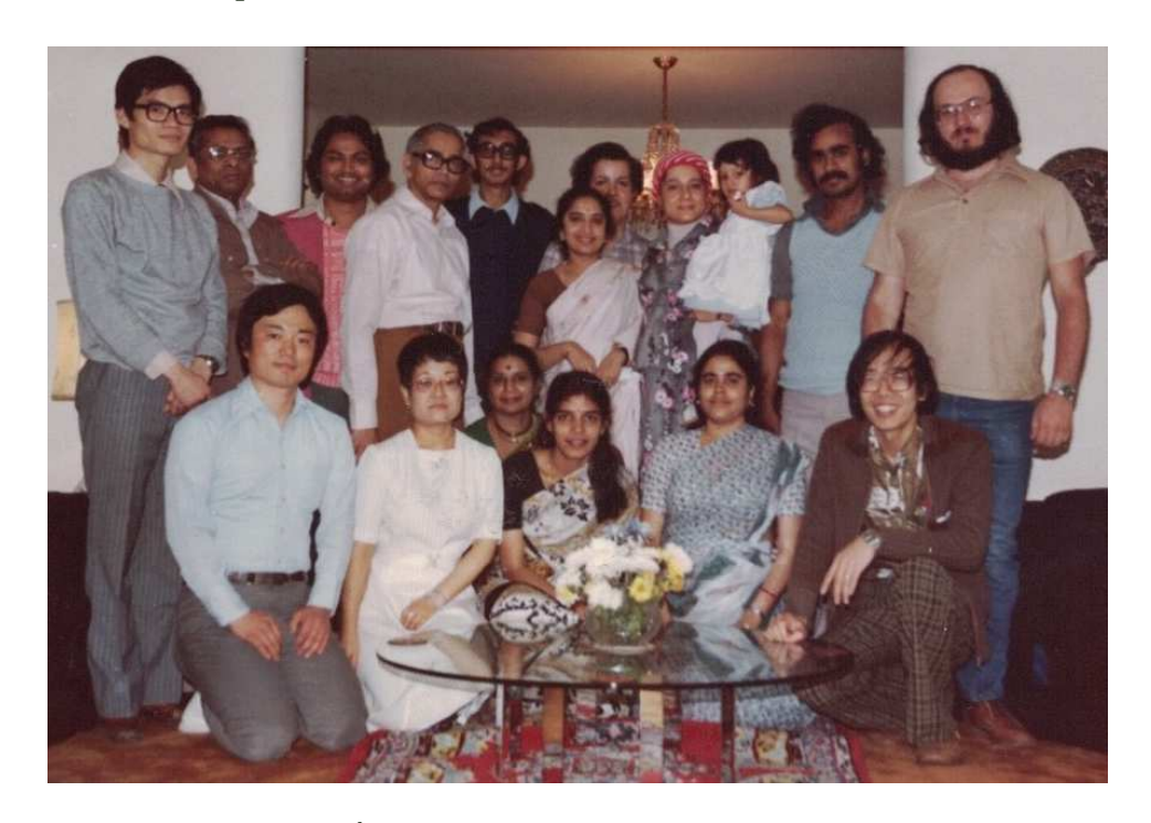
Figure 2: C.R. Rao (standing 4<sup>th</sup> from the left) with family, friends, students in Pittsburgh, USA, during the 1980s. With P.R. Krishnaiah (standing 2<sup>nd</sup> from the left), Rao established in 1982 a unique Center for Multivariate Analysis at the University of Pittsburgh.

Figure 1: C.R. Rao in Cambridge during the 1940s. For discussion on the cranial capacity formula shown in the picture, see Rao and Shaw (1948).